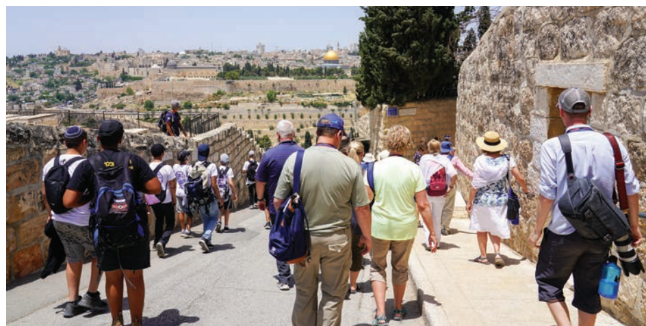
Above: On the Sea of Galilee. Right: Walking down the Palm Sunday road toward Jerusalem.