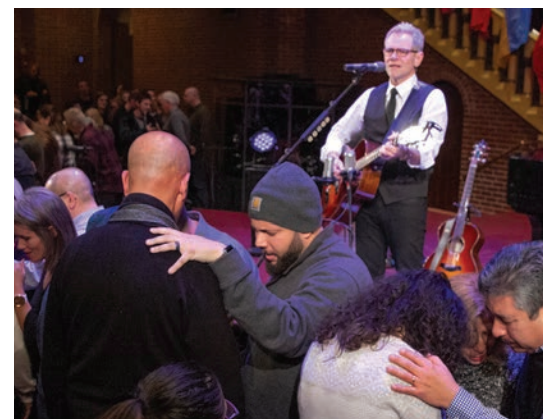
Founder's Week ended with an impromptu time of prayer.

Men and women, young and old, came streaming down the aisles, gathering to pray. Steven Curtis Chapman kept singing and then offered his own benediction: "I love when the Holy Spirit