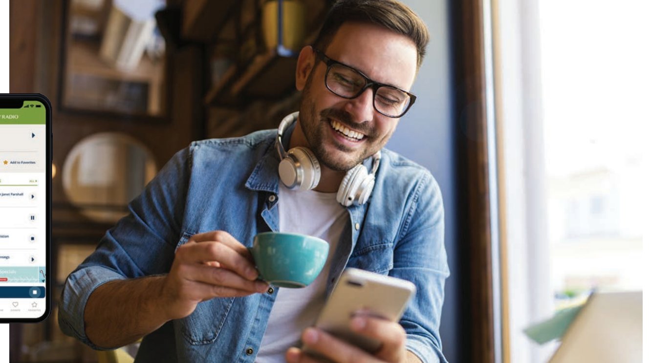
The new and improved Moody Radio app allows listeners to tune in wherever they are.

“Thank God for Moody Radio. Each day I am filled with joy in serving the Lord Jesus. I live in the south of Brazil. I listen daily through the internet.”