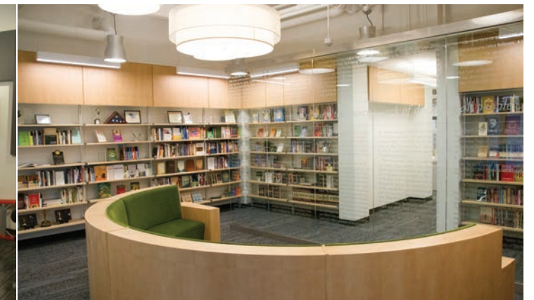
The Moody Publishers library features recent publications.

In December 2018 Moody Radio and Moody Publishers staff officially moved in to the new building. What a year it has been as we’ve begun to settle in and take advantage of this innovative new space.