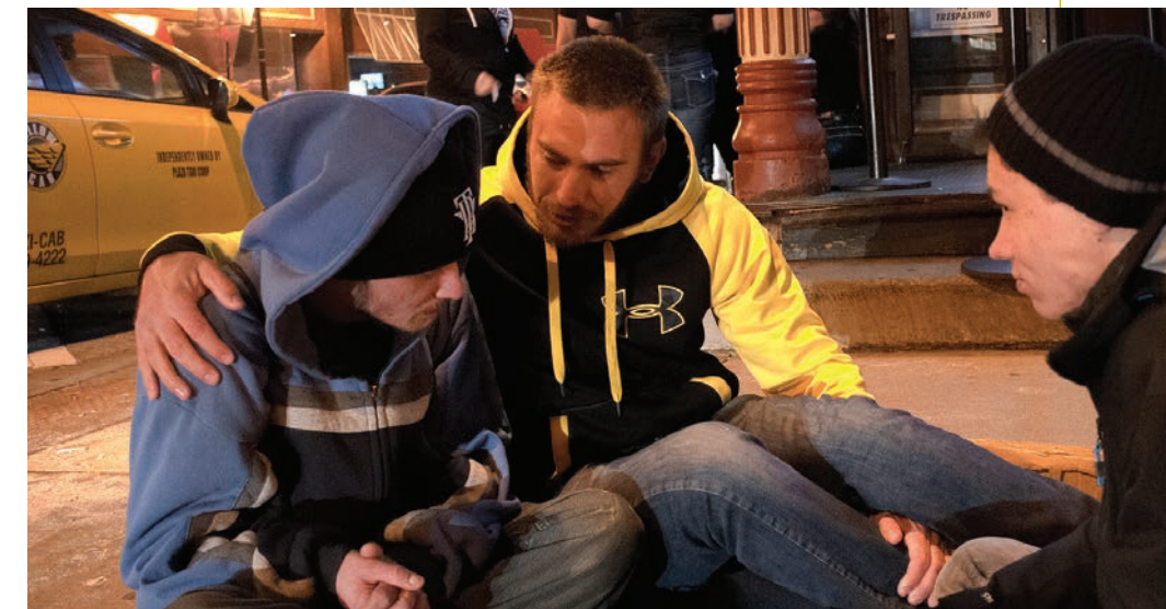
Moody students offer to pray with people on the streets of Chicago.

My prayer every single day was and is, "God, use me today, however you see fit." I graduated from Moody and came back to California, where I am still doing Free Prayer, which is also in Chicago, Texas, and Wyoming. It is growing and spreading.